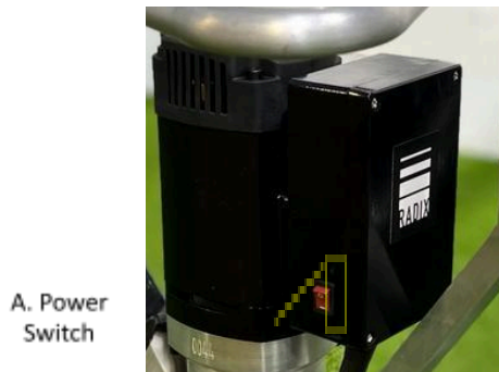
B. Forward & Reverse